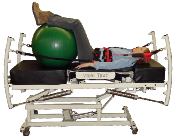
Patent 8257285 B2

The VibroTrac Table allows for longitudinal traction on the spine, with an emphasis on “unwinding” the spine using opposite lateral flexion to achieve de-rotation of vertebra.